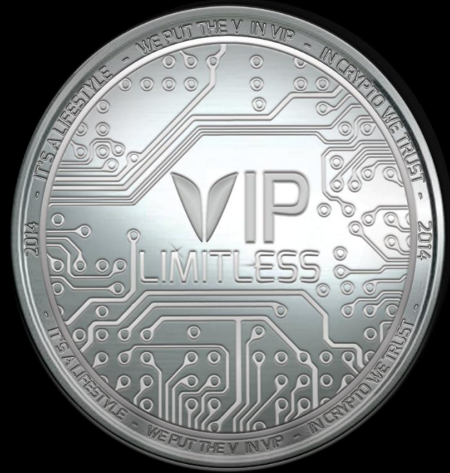
VIP COIN FRONT

Limitless – VIP has been developed on Blockchain technology which was first used by Bitcoin.