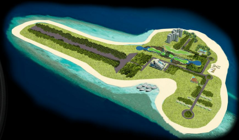
LIMITLESS ISLAND AERIAL VIEW

Apart from being a payment option for Limitless VIP, the ultimate goal of VIP is to be the exclusive currency of future development Limitless Island, a luxury resort style holiday destination with time share possibilities. Limitless Island is a huge project that will span over a 5-year period, during this process investors will have clear milestone targets.